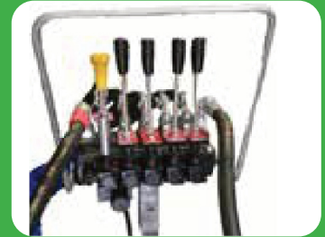
Standard Manual Control