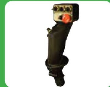
Optional Electric Joystick (Req. Tractor w/ Cab)